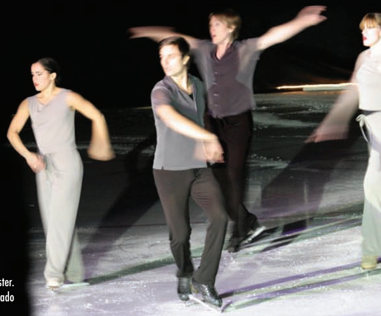
Ice Theatre Ensemble in Meditations. Choreographed by Douglas Webster.